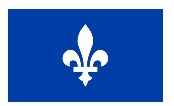
Quebec Trip Hoodies have arrived! Please see Madame Di Marco for pick up in Room 205 at lunch.